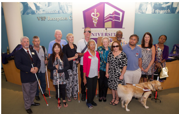
Shared Visions artists in attendance at Opening Reception

American Academy of Optometry (AAO) & Alumni Reception November 12-15, 2014 Denver, CO